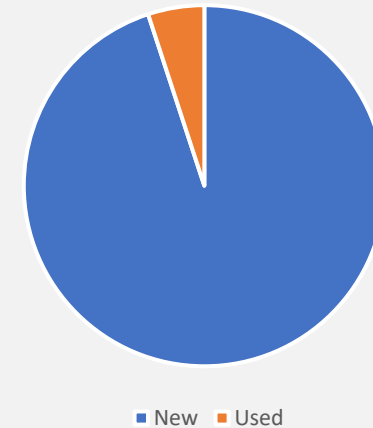
Purchased vs. Leased