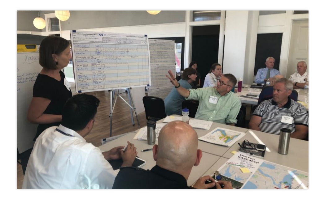
Community Resilience Building Workshop, 2019