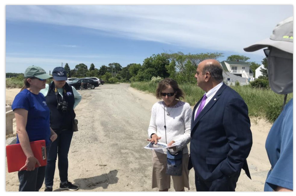
CRMC, URI, Save the Bay, and City of Warwick collaborate on resilient solutions at Oakland Beach – SAID Program, 2019